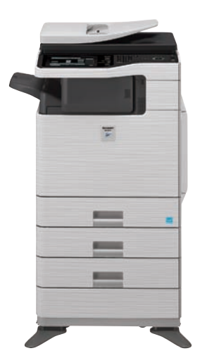
Base Unit Finisher 2 x Paper Drawers Stackable Cabinet Base Plate