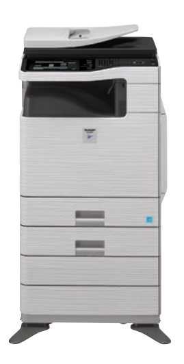
Base Unit Paper Drawer 2 x Stackable Cabinets Base Plate